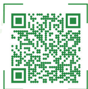
Presentation pod – Pattern on Demand®

Gertsch Consulting & Mode Vision has been your partner in the fashion and apparel industry since 1997. The topic of «mass customisation» and «fashion on demand» has been a field of activity of ours since 2008. Through joint and interdisciplinary cooperation with our customers and partners, we created the pod – Pattern on Demand® platform for manufacturers and suppliers of customised made-to-measure clothing in 2012. pod – Pattern on Demand® is constantly being improved and is in use throughout Switzerland and internationally.